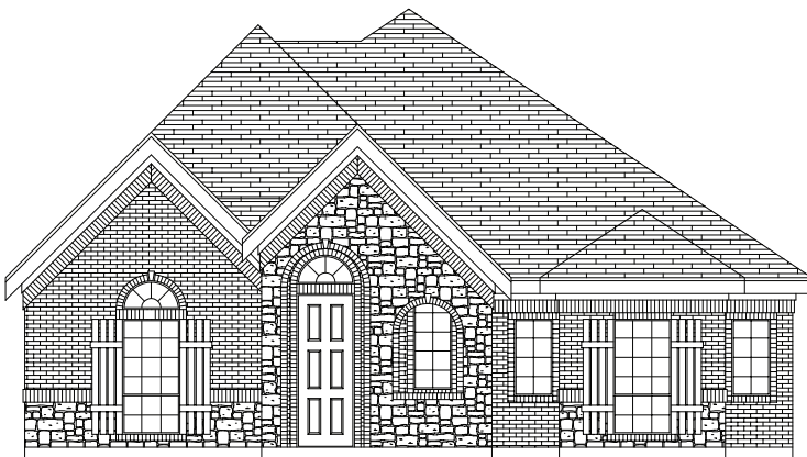
PREMIUM ELEVATION D