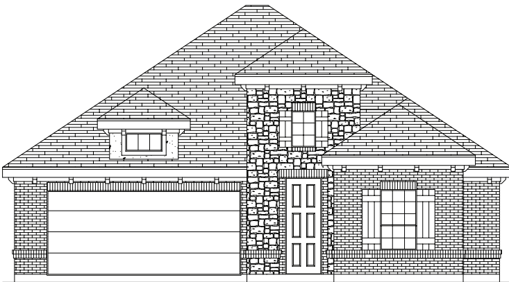
PREMIUM ELEVATION C