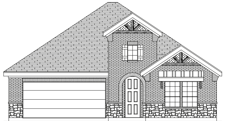
PREMIUM ELEVATION D