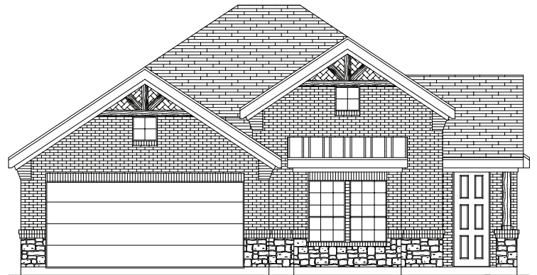
PREMIUM ELEVATION D