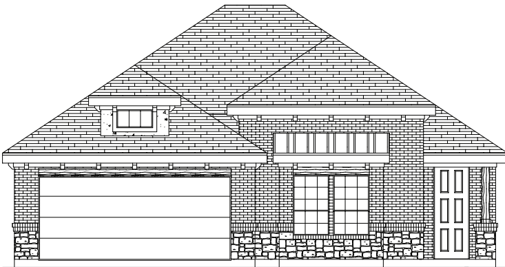
PREMIUM ELEVATION C