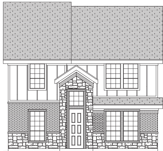
PREMIUM ELEVATION D