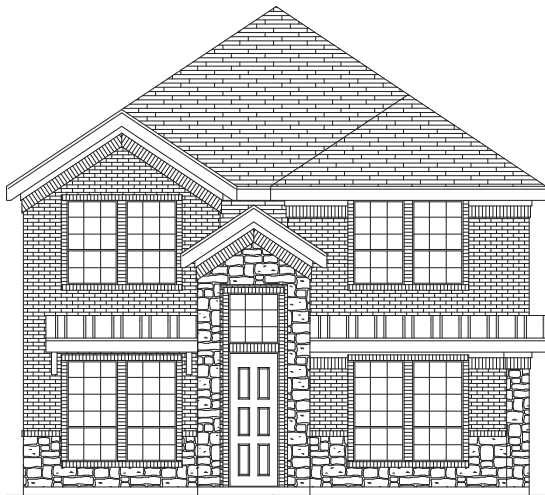
PREMIUM ELEVATION C