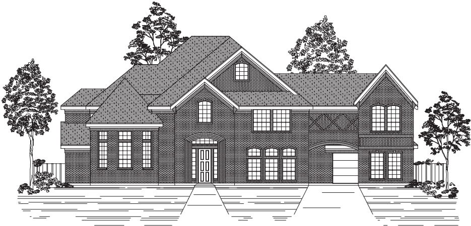
A STANDARD ELEVATION