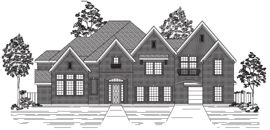
B STANDARD ELEVATION