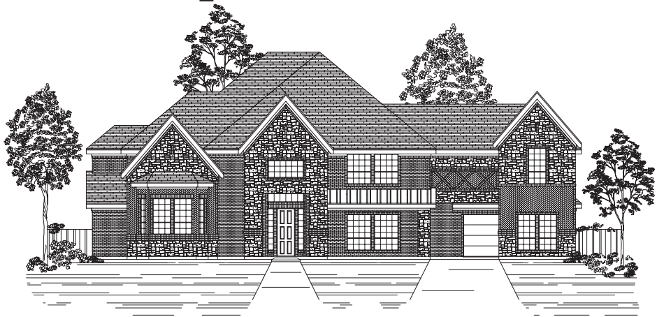
D PREMIUM ELEVATION

Elevations are designers' interpretation. Variations will occur with finished product.