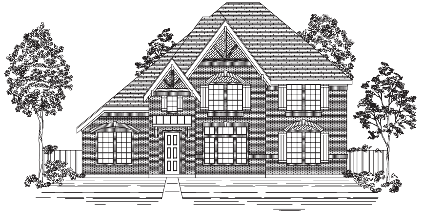
B PREMIUM ELEVATION