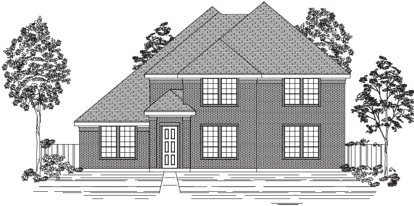
A STANDARD ELEVATION