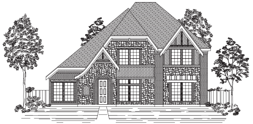
D PREMIUM ELEVATION

Elevations are designers' interpretation. Variations will occur with finished product.