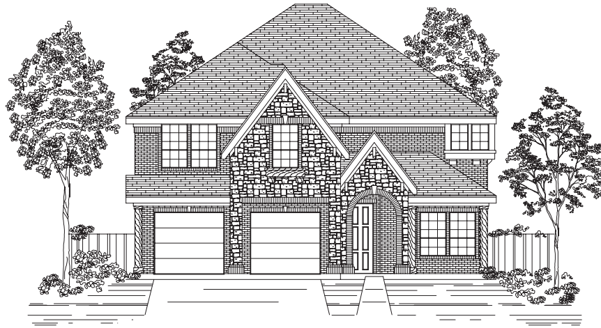
A PREMIUM ELEVATION