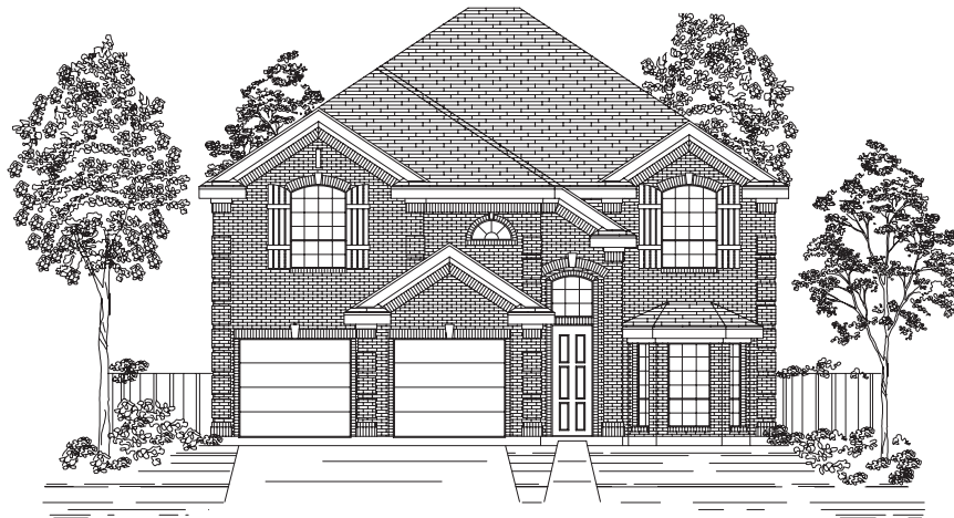
B STANDARD ELEVATION