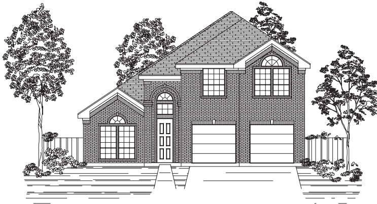
A STANDARD ELEVATION