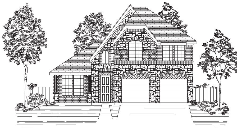
E PREMIUM ELEVATION