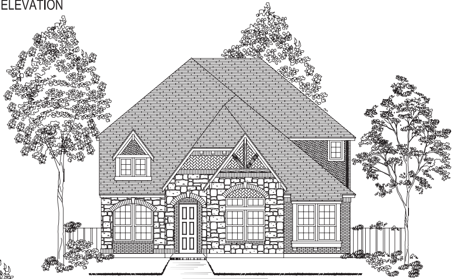
B PREMIUM ELEVATION