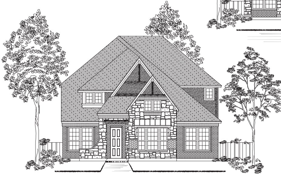
C PREMIUM ELEVATION