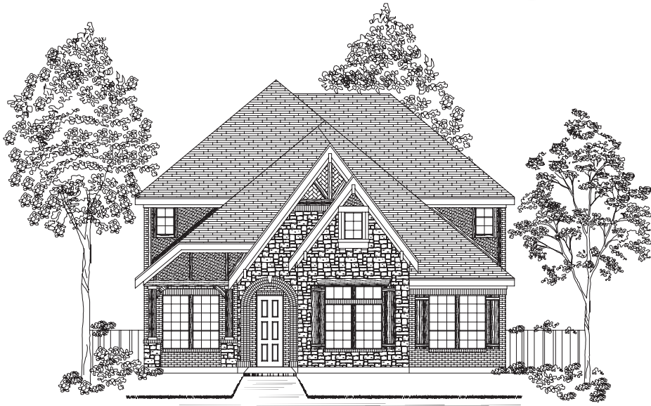
A PREMIUM ELEVATION