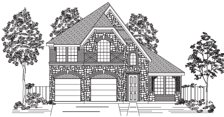
E PREMIUM ELEVATION

Elevations are designers' interpretation. Variations will occur with finished product.