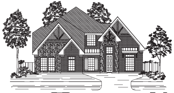
F PREMIUM ELEVATION