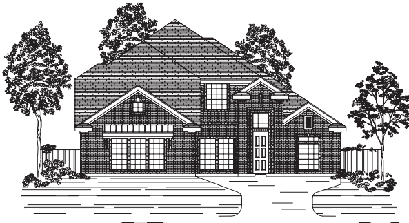
E PREMIUM ELEVATION