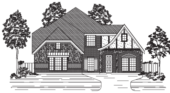
J PREMIUM ELEVATION

Elevations are designers' interpretation. Variations will occur with finished product.