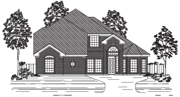
B STANDARD ELEVATION