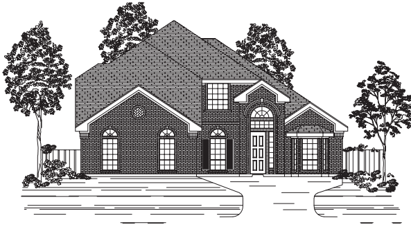
A STANDARD ELEVATION