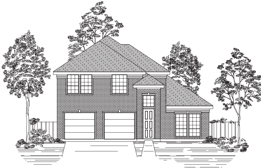
A STANDARD ELEVATION