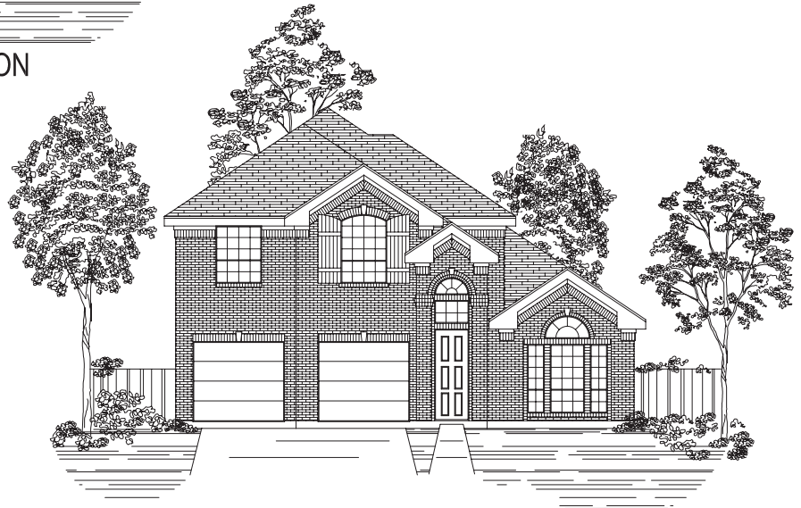
B STANDARD ELEVATION