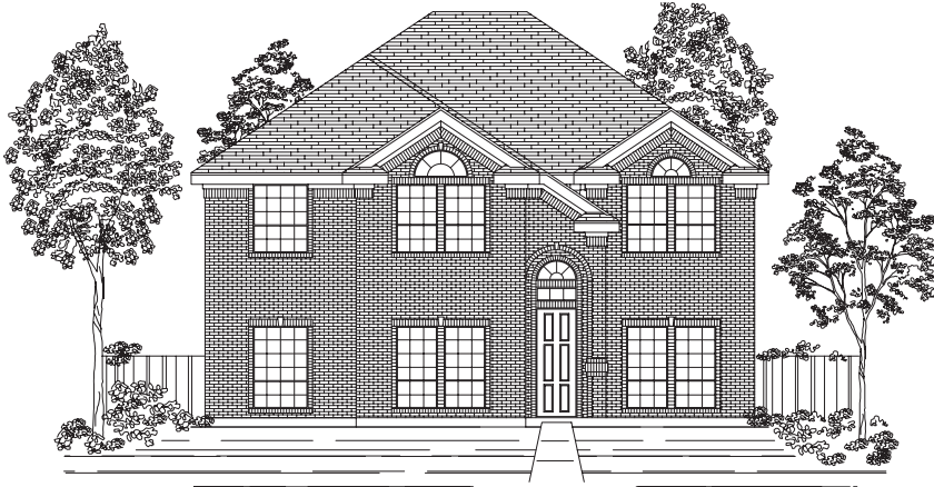
A STANDARD ELEVATION