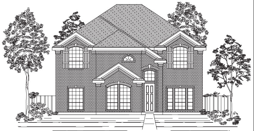
B STANDARD ELEVATION