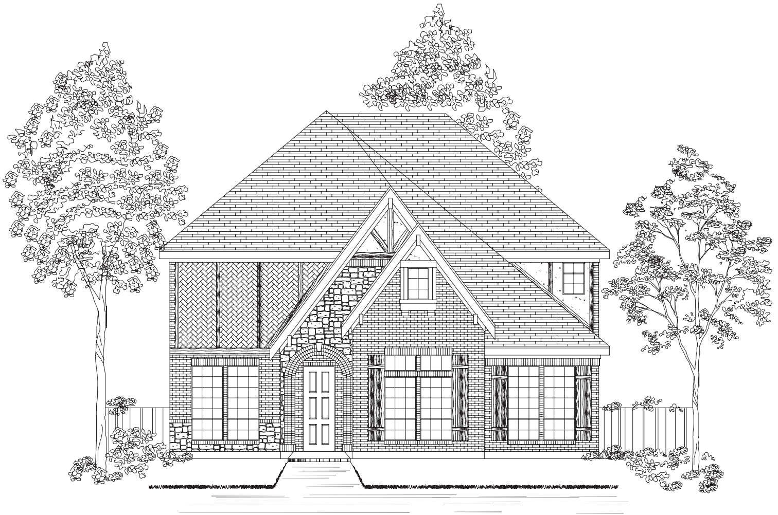
A PREMIUM ELEVATION