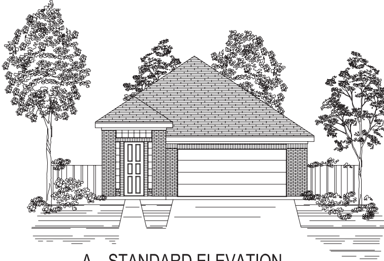
A STANDARD ELEVATION