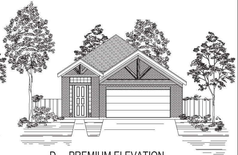
D PREMIUM ELEVATION

Elevations are designers' interpretation. Variations will occur with finished product.