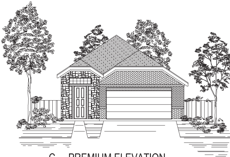
C PREMIUM ELEVATION