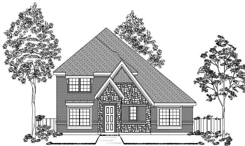
C PREMIUM ELEVATION