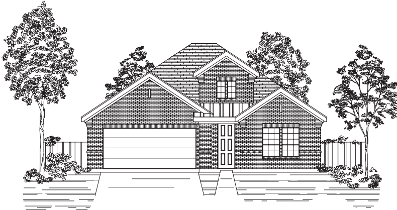
A STANDARD ELEVATION