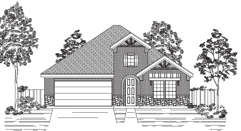
D PREMIUM ELEVATION