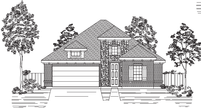
C PREMIUM ELEVATION