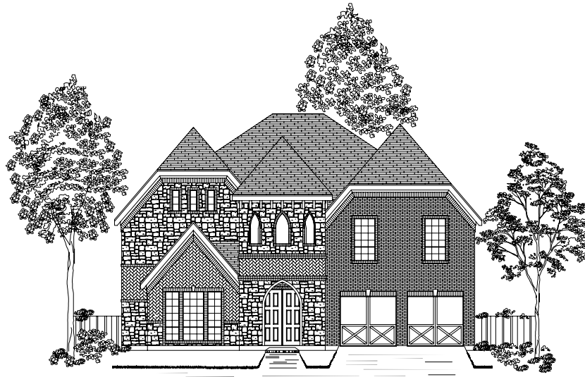
C PREMIUM ELEVATION