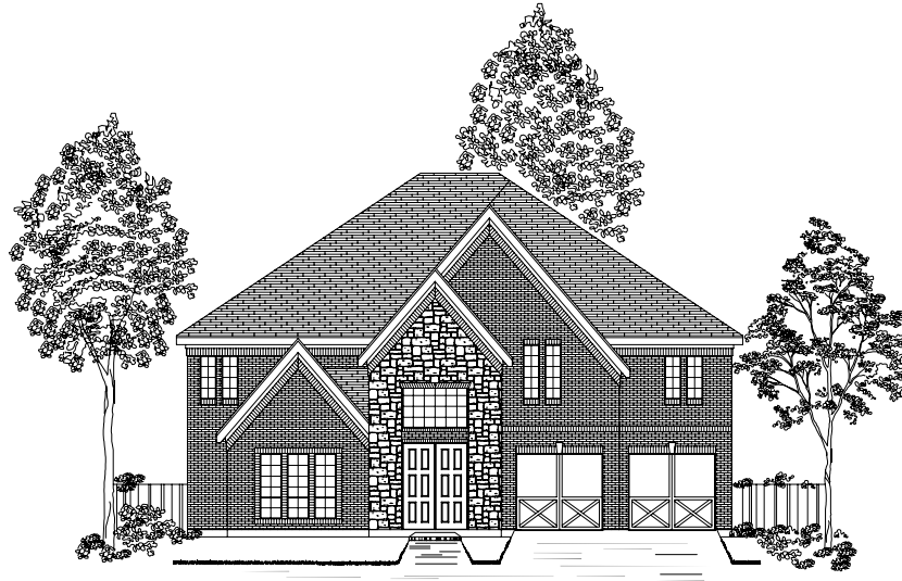
B STANDARD ELEVATION SHOWN WITH OPTIONAL WOOD GARAGE DOORS & STONE