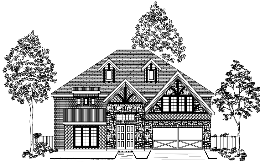
A PREMIUM ELEVATION