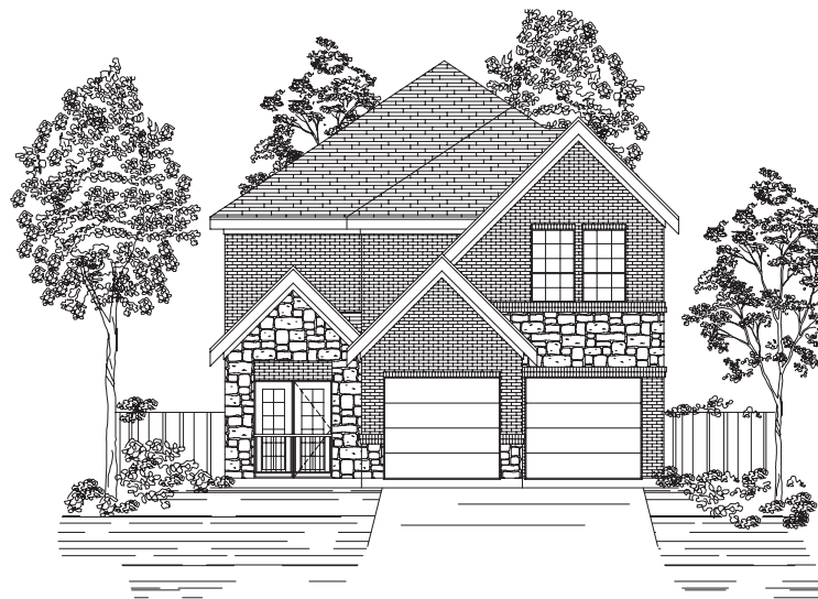
E PREMIUM ELEVATION

Elevations are designers' interpretation. Variations will occur with finished product.