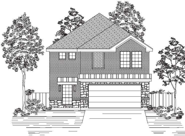
C PREMIUM ELEVATION