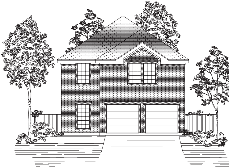
A STANDARD ELEVATION