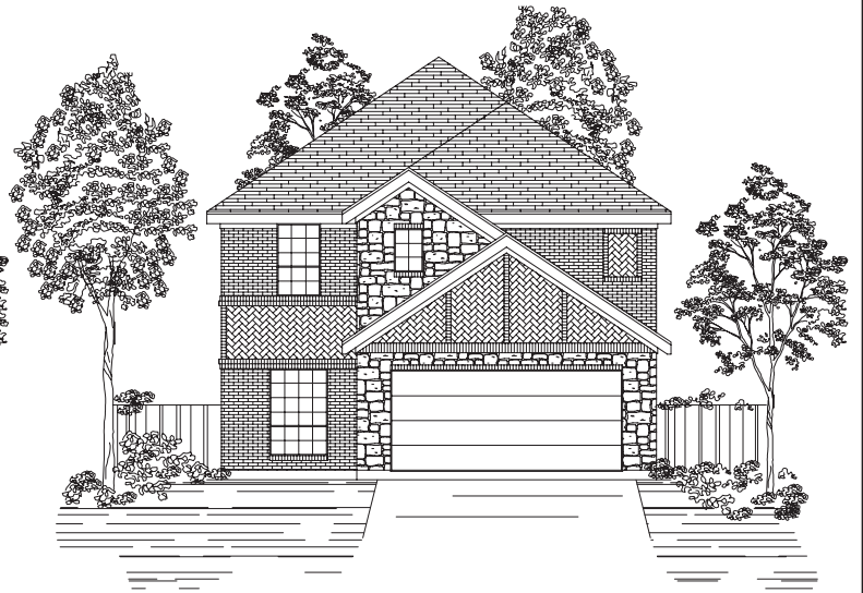
D PREMIUM ELEVATION