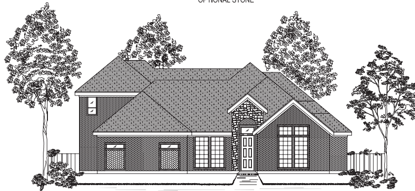
D SHOWN WITH OPTIONAL STONE