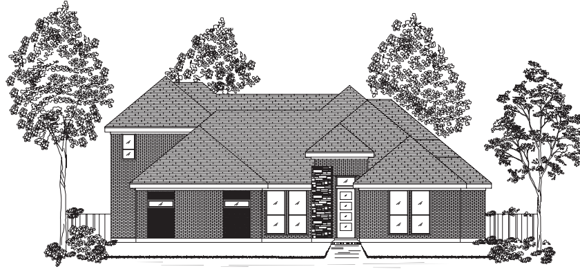
A SHOWN WITH OPTIONAL STONE