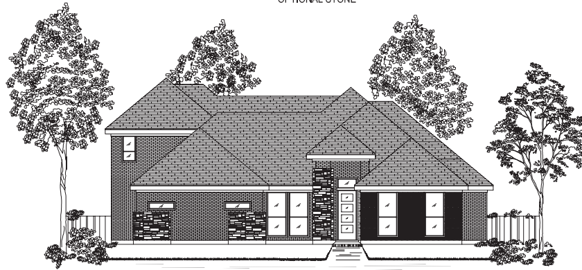
C SHOWN WITH OPTIONAL STONE