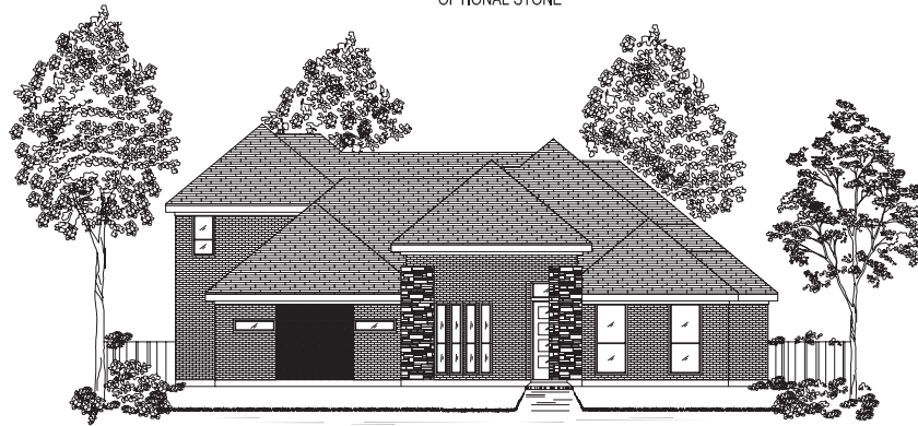
B SHOWN WITH OPTIONAL STONE