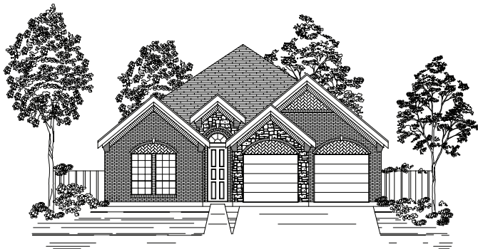
E PREMIUM ELEVATION