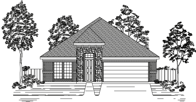
C PREMIUM ELEVATION