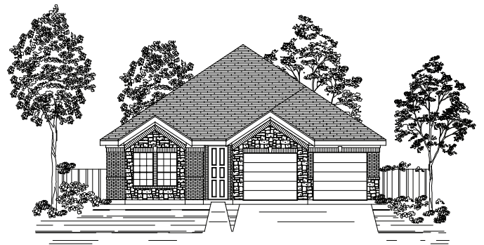
F PREMIUM ELEVATION