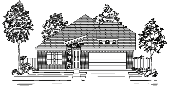
B PREMIUM ELEVATION