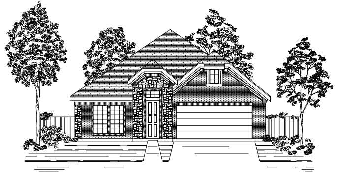
D PREMIUM ELEVATION