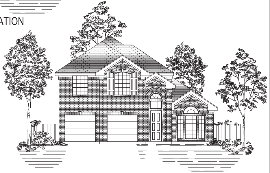
B STANDARD ELEVATION