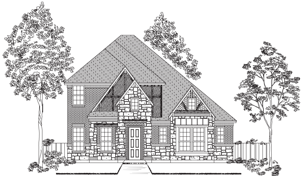
B PREMIUM ELEVATION