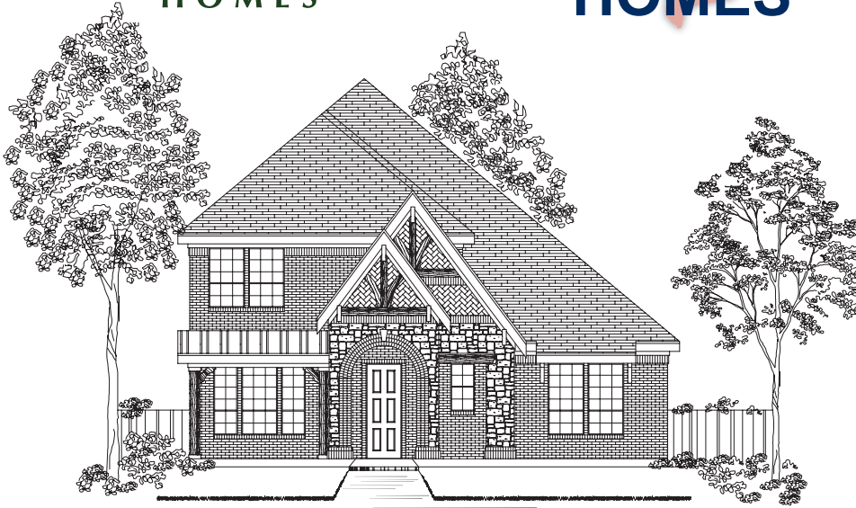
A PREMIUM ELEVATION