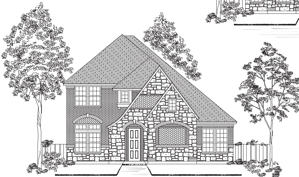
C PREMIUM ELEVATION