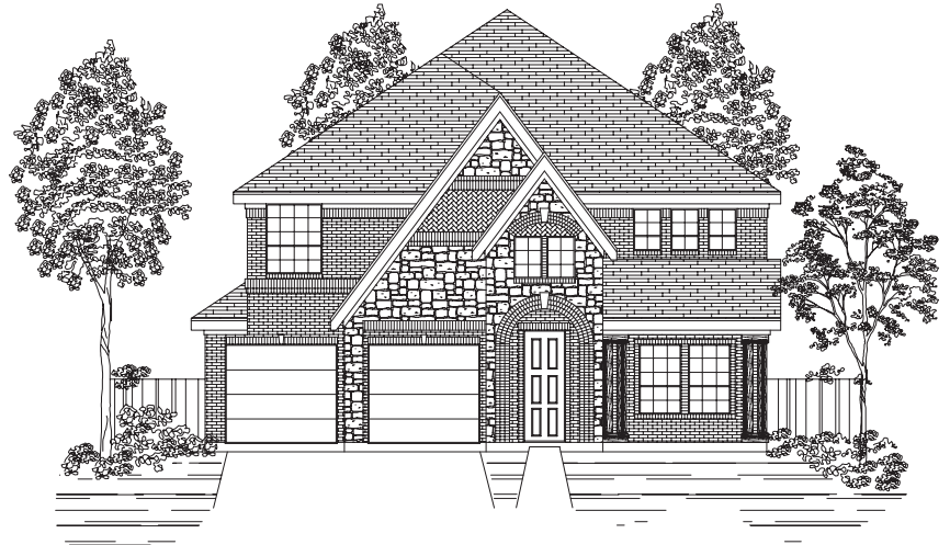
B PREMIUM ELEVATION