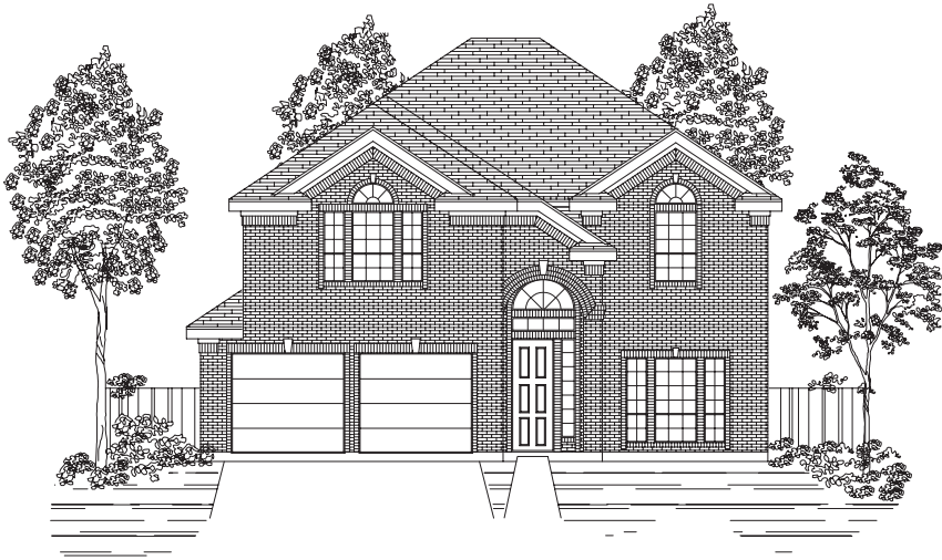
A STANDARD ELEVATION