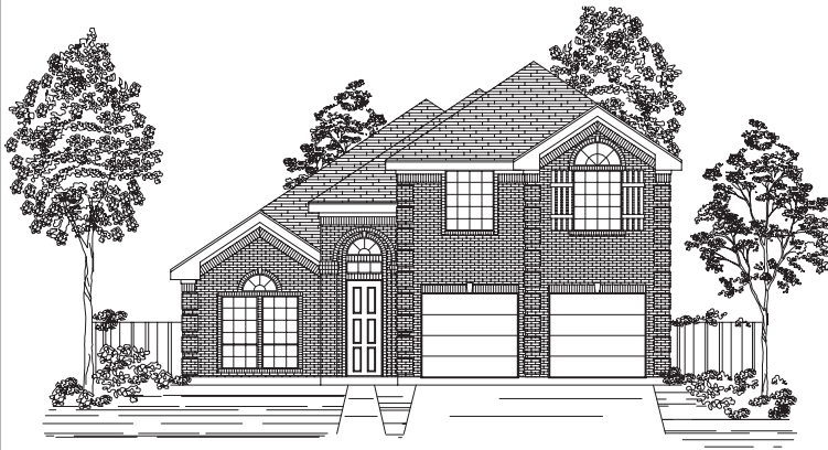
A STANDARD ELEVATION