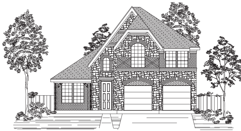
E PREMIUM ELEVATION