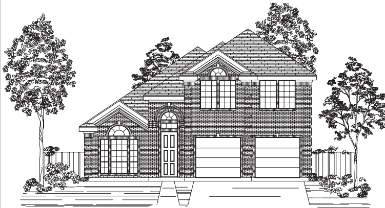
C STANDARD ELEVATION