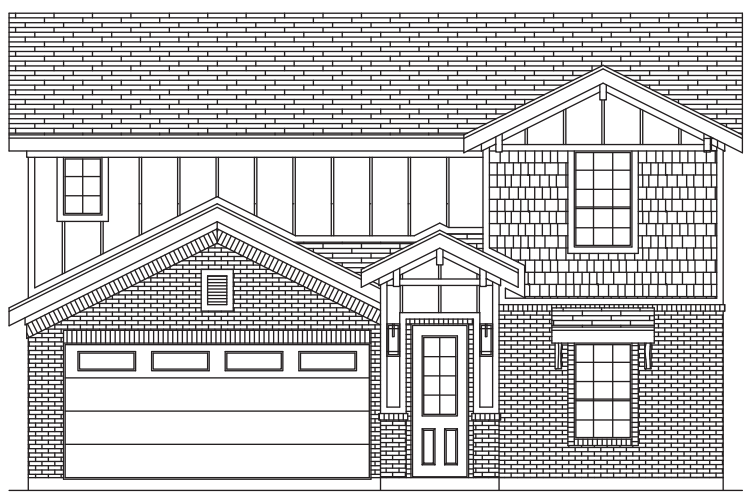
PREMIUM ELEVATION D