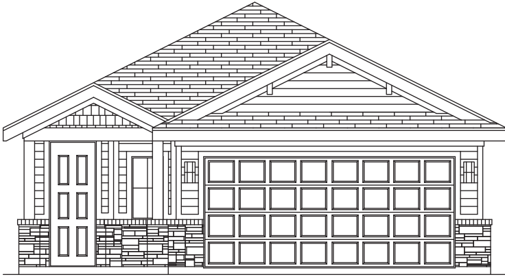
PREMIUM ELEVATION A