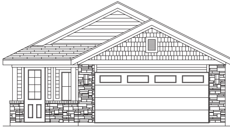
PREMIUM ELEVATION C