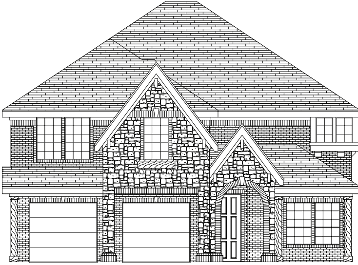
PREMIUM ELEVATION A