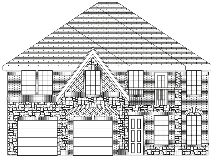
PREMIUM ELEVATION C