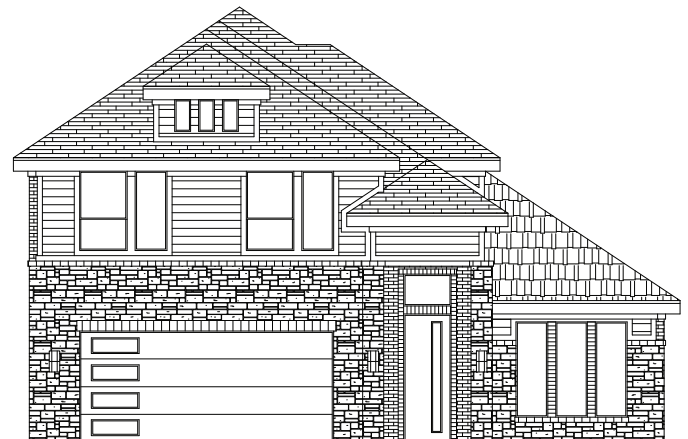
PREMIUM ELEVATION F