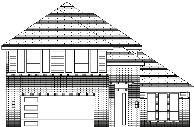
PREMIUM ELEVATION E