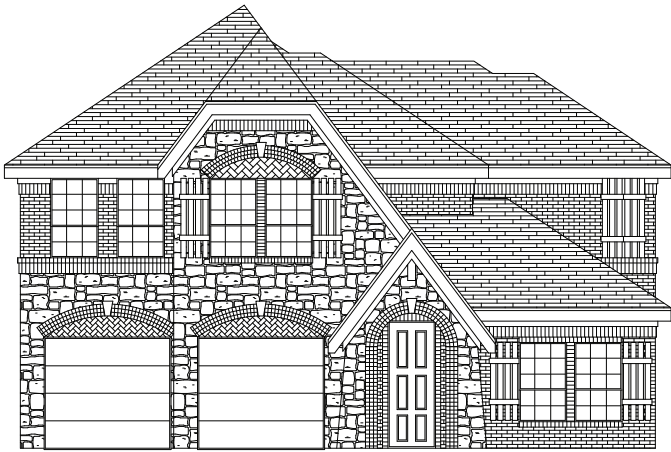
PREMIUM ELEVATION B