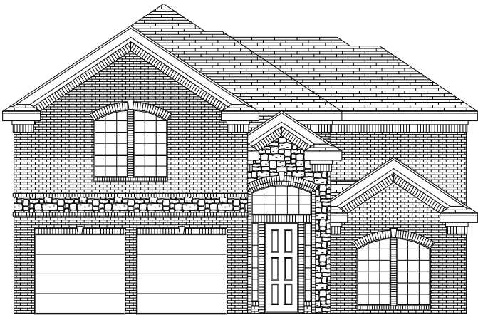
PREMIUM ELEVATION E