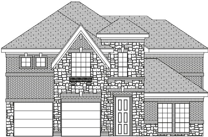
PREMIUM ELEVATION D