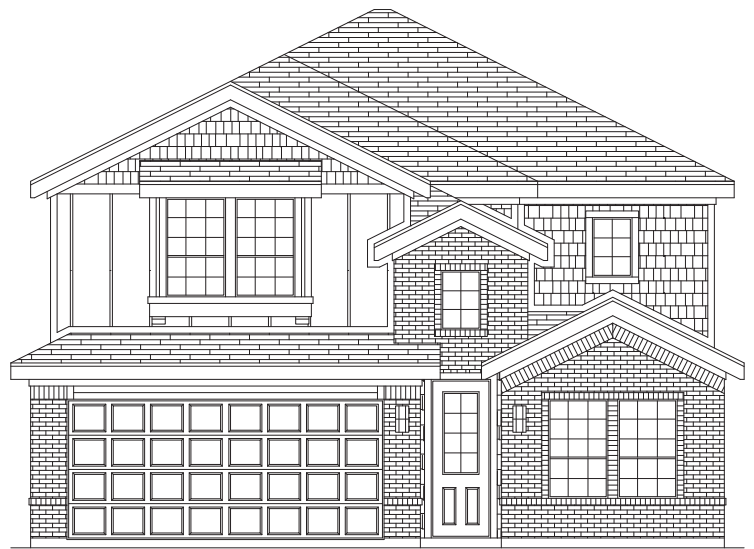
PREMIUM ELEVATION D