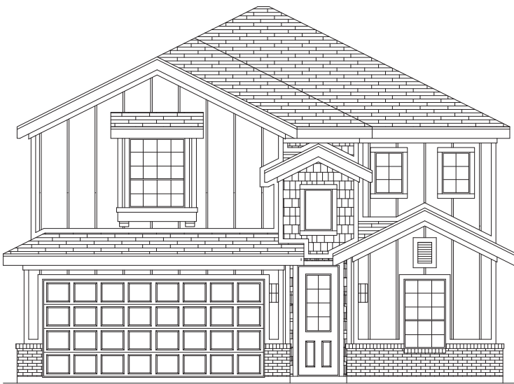
PREMIUM ELEVATION C