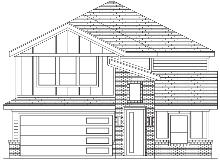
PREMIUM ELEVATION B