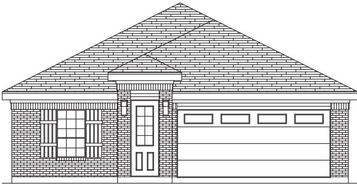
PREMIUM ELEVATION C