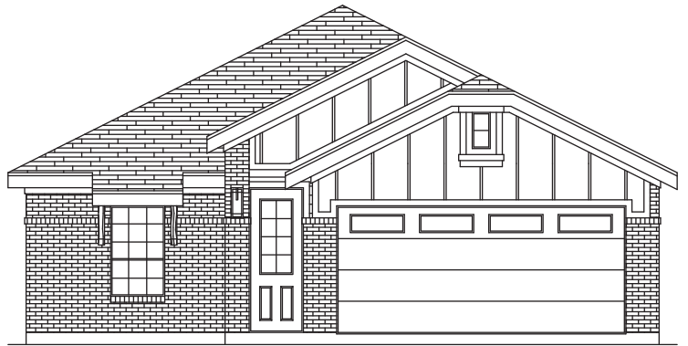
PREMIUM ELEVATION D